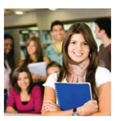
13 Faculty of Business, Leadership and Management