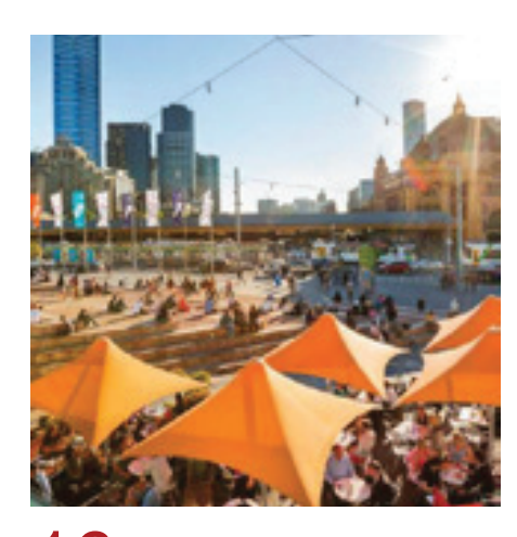
16 Cost of Living