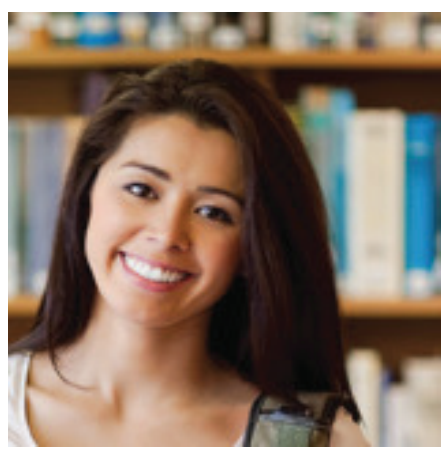
Student Support Services