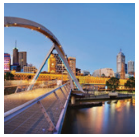
4 About Melbourne