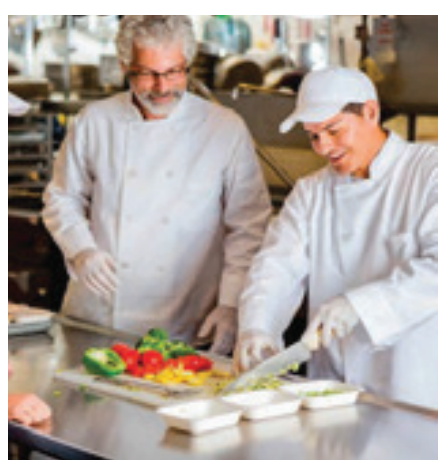
7 Faculty of Hosptality Management